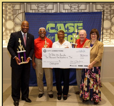
Last year's CASE for Kids City Connections photo opportunity was held at City Hall.

Several CASE for Kids City Connections nonprofits and Houston City Council members will gather February 23 from 9 a.m.-1 p.m. at 6300 Irvington, room 400, to celebrate the successes of the program that brought $45,000 from the city of Houston to afterschool through each